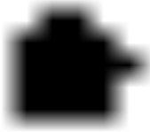
CHART IV — CHART OF THE PLEROMA ACCORDING TO VALENTINUS 95* First the

(Point), the Monad , Bythus(the Deep), the unknown and